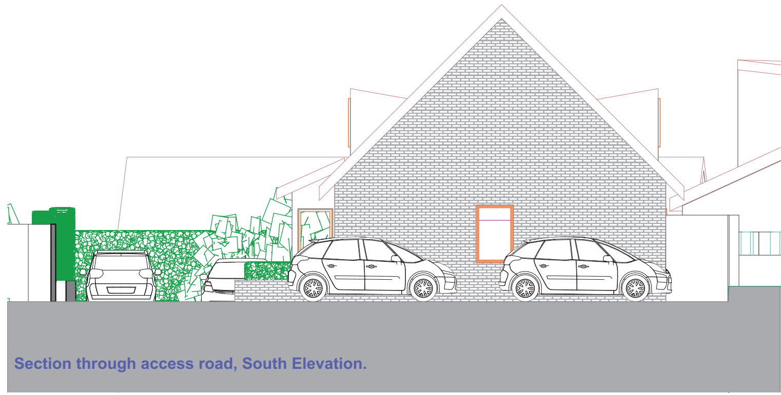
Section through access road, South Elevation.